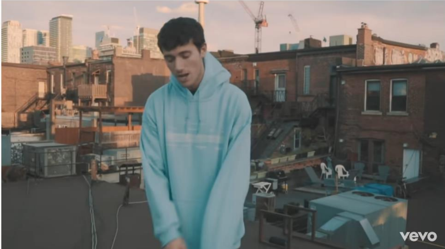
Jeremy Zucker - comethru (Official Video)